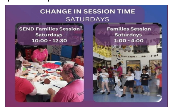
The Way-School Street, Wolverhampton, WV3 ONR.